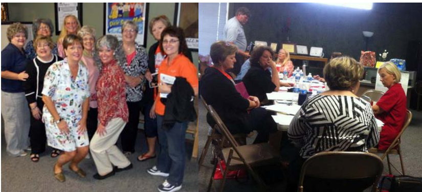
OCTA Board 2011 Retreat in Ponca City! Left: Board with the cast of “Dixie Swim Club” Right: Board hard at work!