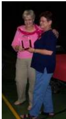
Grove Playmakers, Grove

OCTAVISION is given to an OCTA member theatre which has established and successfully accomplished a substantial long-range goal.