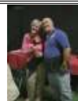
David Gray Heller Theatre