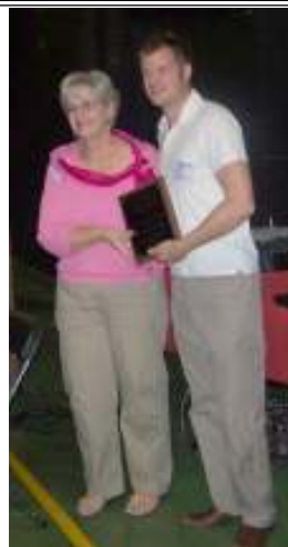
Oklahoma Arts Council

HALL OF HONOR is awarded when there is deemed a worthy recipient. Criteria include the nominee's contributions to state and local community theatre, involvement in all aspects of theatre work, and OCTA.