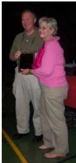
Ardmore Little Theatre, Ardmore

OCTAVISION is given to an OCTA member theatre which has established and successfully accomplished a substantial long-range goal.