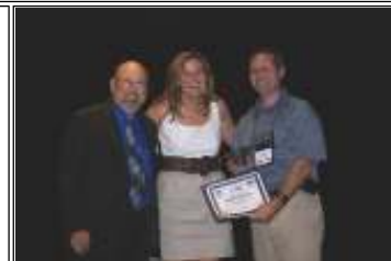
Award for Outstanding Lighting Design