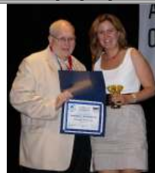
Outstanding Production Third Place