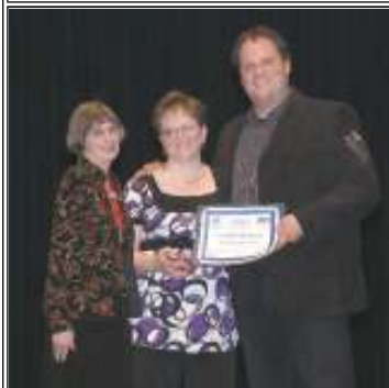
Outstanding Achievement Award for Musical Direction