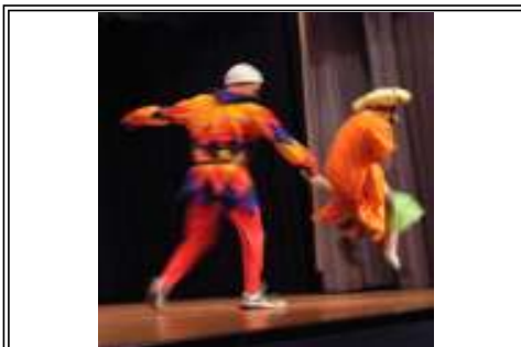
Grove mid-school drama students learned a lot about Commedia Dell'Arte in their joint production with the Grove Playmakers, "The Love For Three Oranges." The show was part of The Playmakers' in-school program and was performed for all 6th grade students.