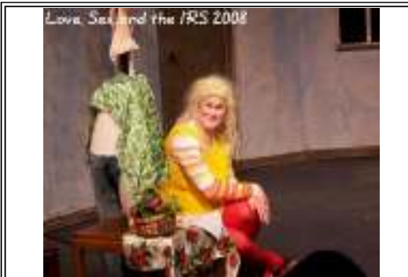
Theatre Tulsa presented "Love, Sex, and the IRS" at the Tulsa Performing Arts Center in April.

If you wish to nominate a theatre, the nomination folder or packet should include an outline of the theatre's activities over the past years, should note any growth or positive change in the organization, the contribution to the local community, and major achievements/projects completed in the past. In other words, brag about their accomplishments!